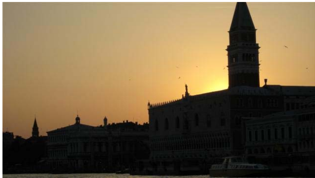
Venice, taken during the Nanotoxicology Conference, April 2007